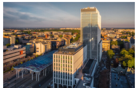
HI Piotrowska 155 Complex