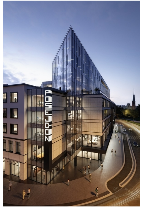
ROSEIDON Office Complex