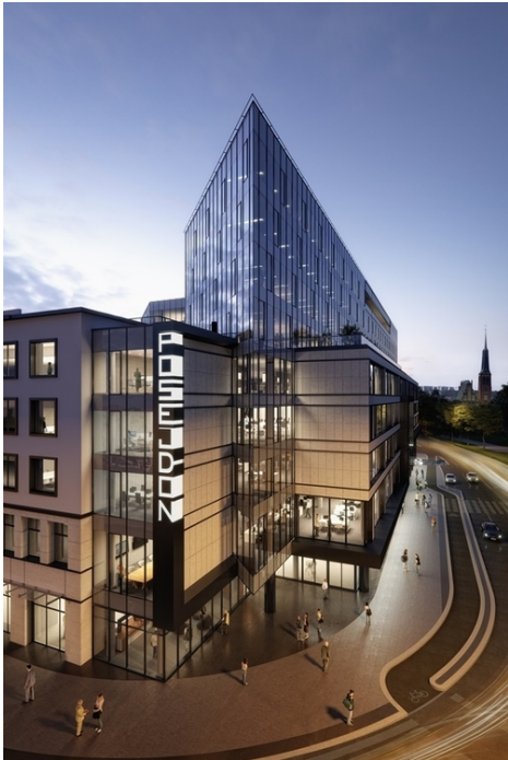
ROSEJDON Office Complex