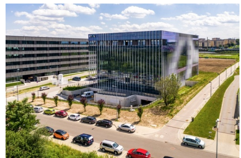
RYVU THERAPEUTICS LABORATORY