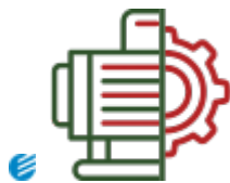
Installation of Heat Pumps