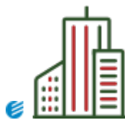
Building Energy Management