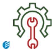
Maintenance services and technical support